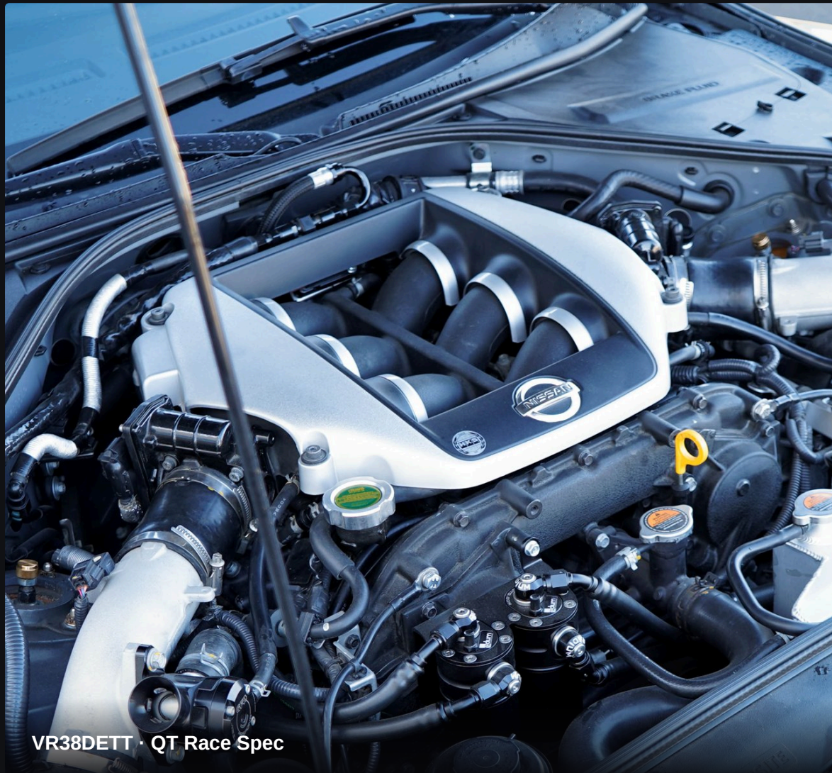
VR38DETT · QT Race Spec