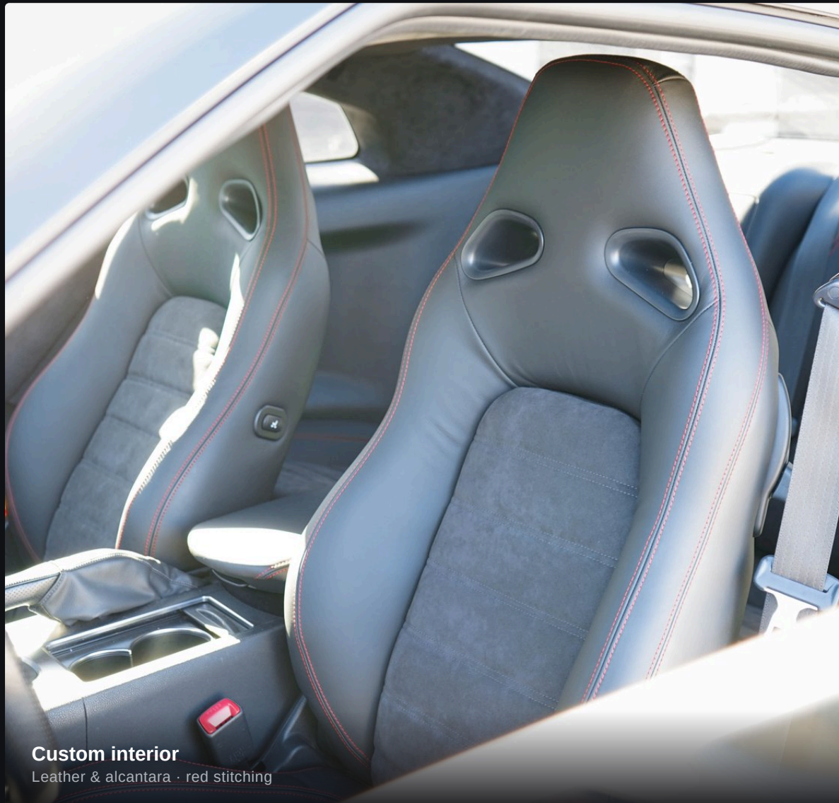
Custom interior Leather & alcantara · red stitching

Interior built by our partner — leather and alcantara with red stitching.